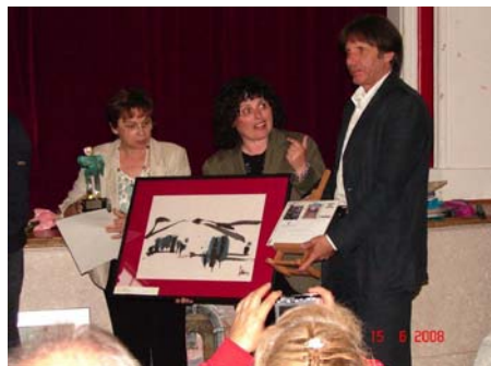
1 st picture winner on 2008 contest