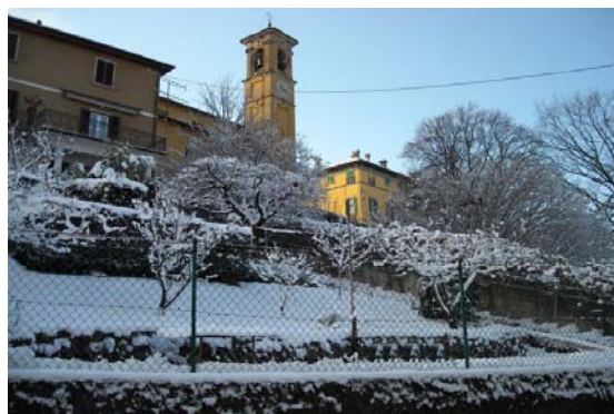
Top Cuvio's church