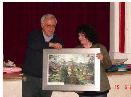
2 nd picture winner on 2008 contest